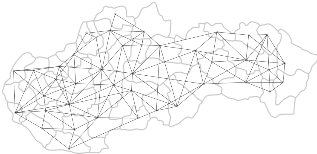
Fig. 1. Underlying graph representing the postal middle-level nodes and their road connections Rys. 1. Wykres prezentujący pocztowe węzły średniego poziomu i ich połączenia drogowe

The graph of addressed network placed on the map of covering regions is presented below (Fig. 1)